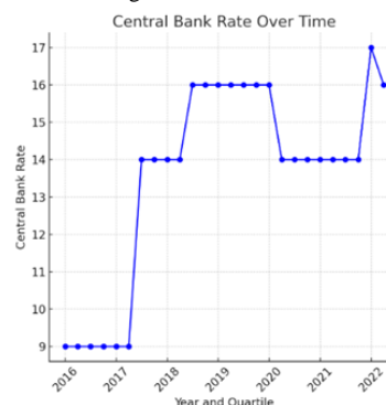
Fig. 1. Dynamics of the Central Bank's rate from 2016 to 2022 1 and Tau-b Kendall correlation methods.

rates and GDP figures across several quarters spanning 2016 to 2022. This period captures a significant phase in Uzbekistan's economic policy and development. The Central Bank's key rate has varied over the years. For instance, in 2017, the rate was as low as 9%, whereas in 2022, it increased to 16-17%. These fluctuations are indicative of the monetary policy adjustments made by the Central Bank in response to various economic conditions. The GDP of Uzbekistan, denominated in billions of sums, shows an increasing trend over these years. For example, in the first quarter of 2016, the GDP was around 47,816.20 billion sums, which increased to 162,784.60 billion sums in the first quarter of 2022. This data serves as the foundation for the study's correlation analysis. It helps in understanding how changes in the Central Bank's rate may correlate with shifts in GDP, considering the complex dynamics of Uzbekistan's evolving economy. The comprehensive nature of this data, covering more than 20 quarters, provides a robust basis for accurately calculating the correlation dependence using statistical methods like the Rho Spearman